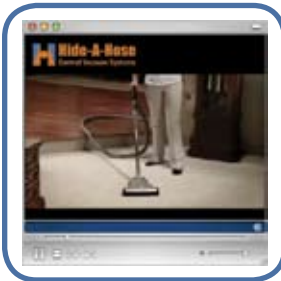
Watch the Video See how easy it works! www.hideahose.biz